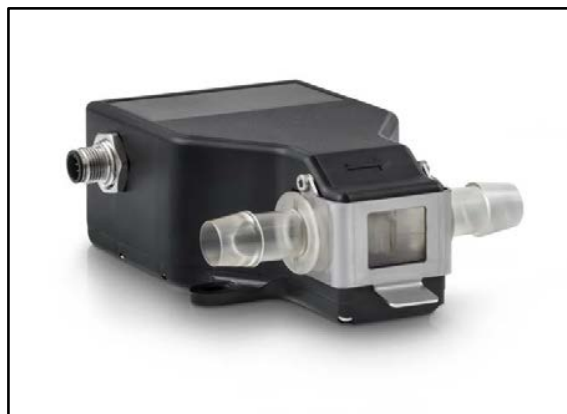
Fig 1. FLEXMAG 4050 C