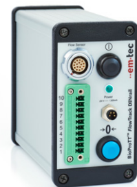
BioProTT™ FlowTrack DINrail