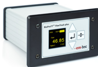
BioProTT™ FlowTrack plus (Panel Mount)