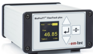
BioProTT™ FlowTrack plus

The BioProTT™ FlowTrack DINrail enables an integration of the system into standard industry racks based on the BioProTT™ FlowTrack fit and function. In addition, a remote zero input interface is provided.